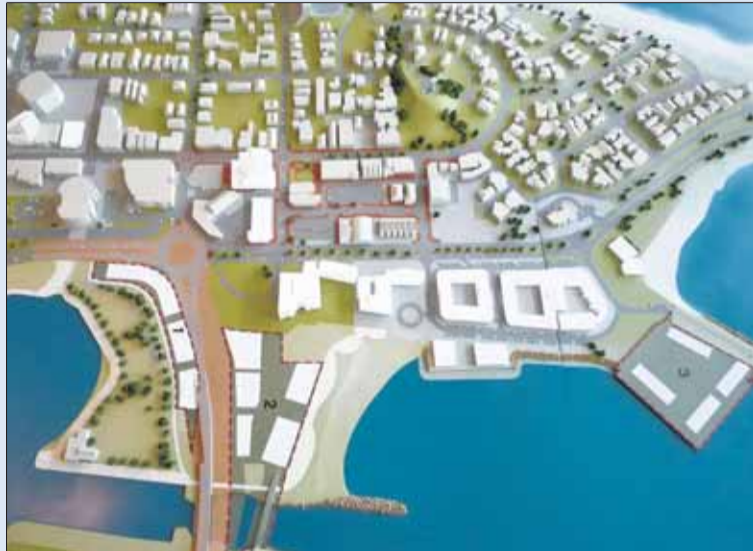
Public comment is being sought on proposed zoning changes for three areas, known as Koombana North, Koombana South and Marlston North.

"And we recognise that people don't want high rise in Bunbury, so instead of 17 storeys in