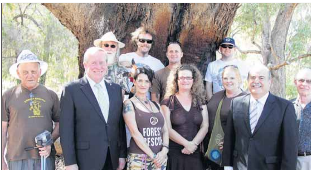
Premier Colin Barnett and John Castrilli met with local conservationists on April 1 to discuss an establishment plan for the Preston River to Ocean Regional Park.

The timeline for construction of the final stage of the project, which will include the flyover, will depend on traffic patterns following construction of the final stage of the Port Access Road and Bunbury Outer Ring Road, which is expected to take traffic pressure off the Eelup Roundabout.